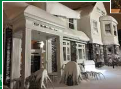
From top: Kingsland Manor in Nutley, Essex County Kip's Castle in Montclair/Verona, and Van Tassel Funeral Home in Bloomfield