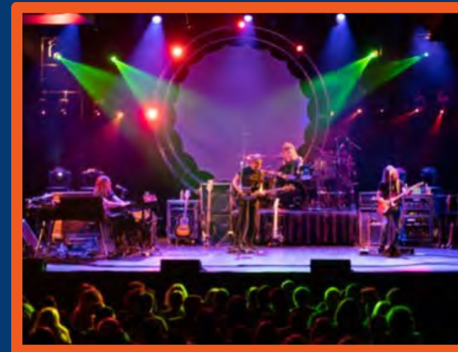
The Machine Performs Pink Floyd SAT, APR 5 at 7:30PM