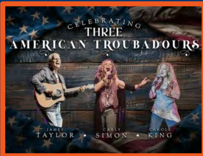
Three American Troubadours FRI, MAR 21 at 7:30PM