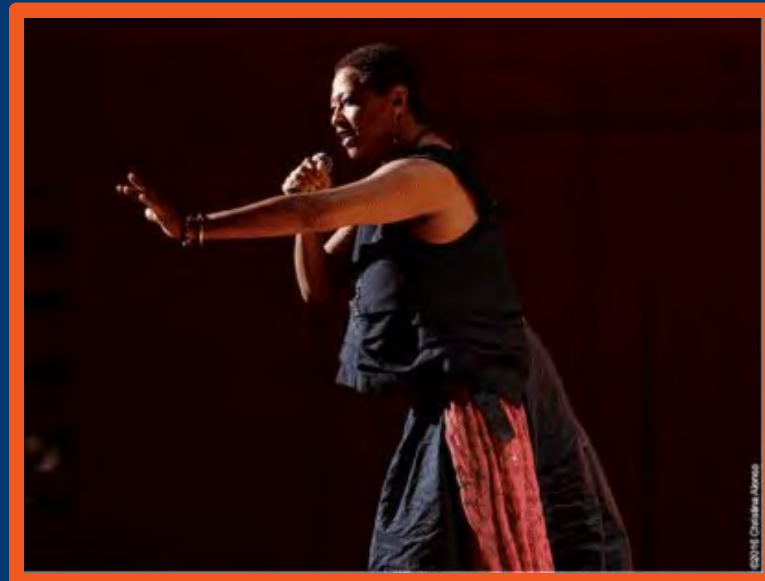
Ms. Lisa Fischer & Grand Baton SAT, FEB 15 at 8PM