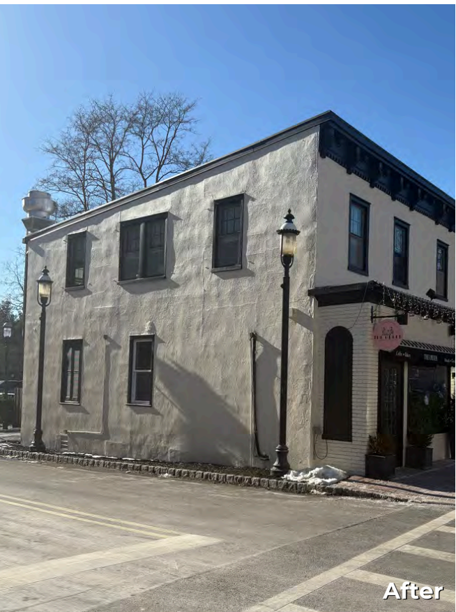
The Facade Improvement Grant covers 75% of costs, up to $2,000, for improvements to downtown facades.