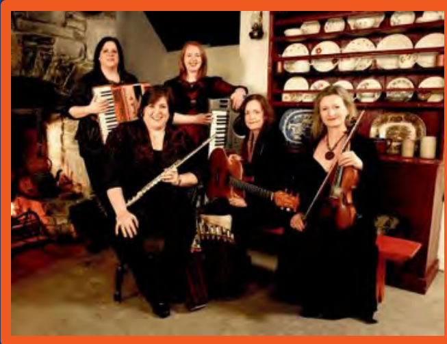
Cherish the Ladies FRI, MAR 7 at 7:30PM