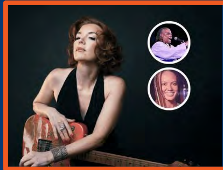
Mike Griot Presents South Orange International Blues Fest FRI, FEB 7 at 7:30PM