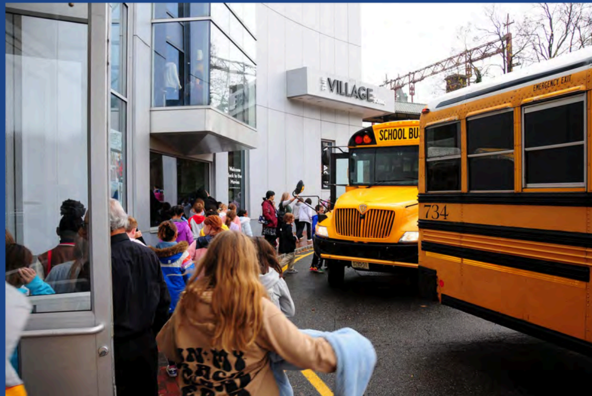
Arts in Education