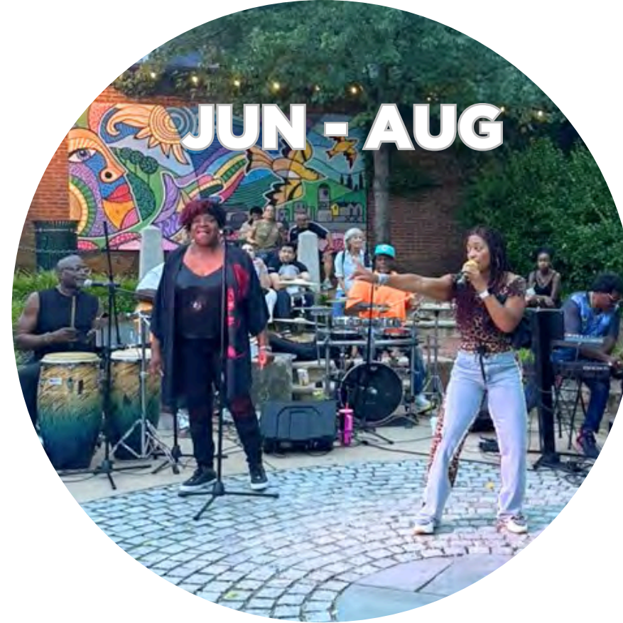
DOWNTOWN AFTER SUNDOWN