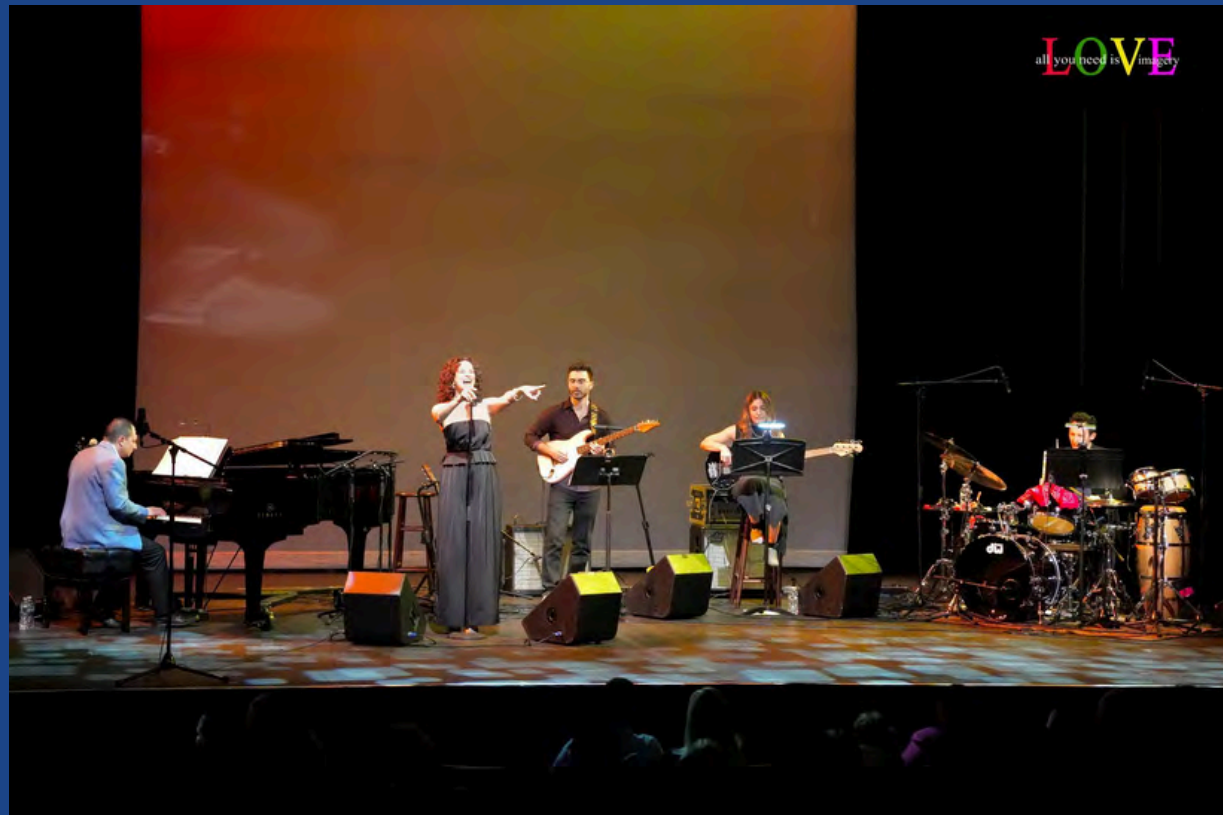
Presenting cultural arts on the stage & in the gallery

A cultural anchor serving the SOMA community