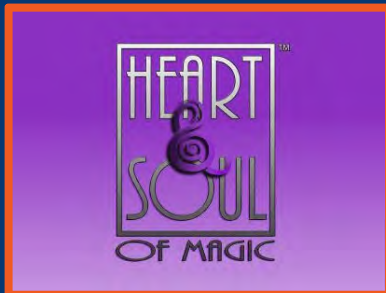
Heart & Soul of Magic SAT, FEB 22 at 1PM