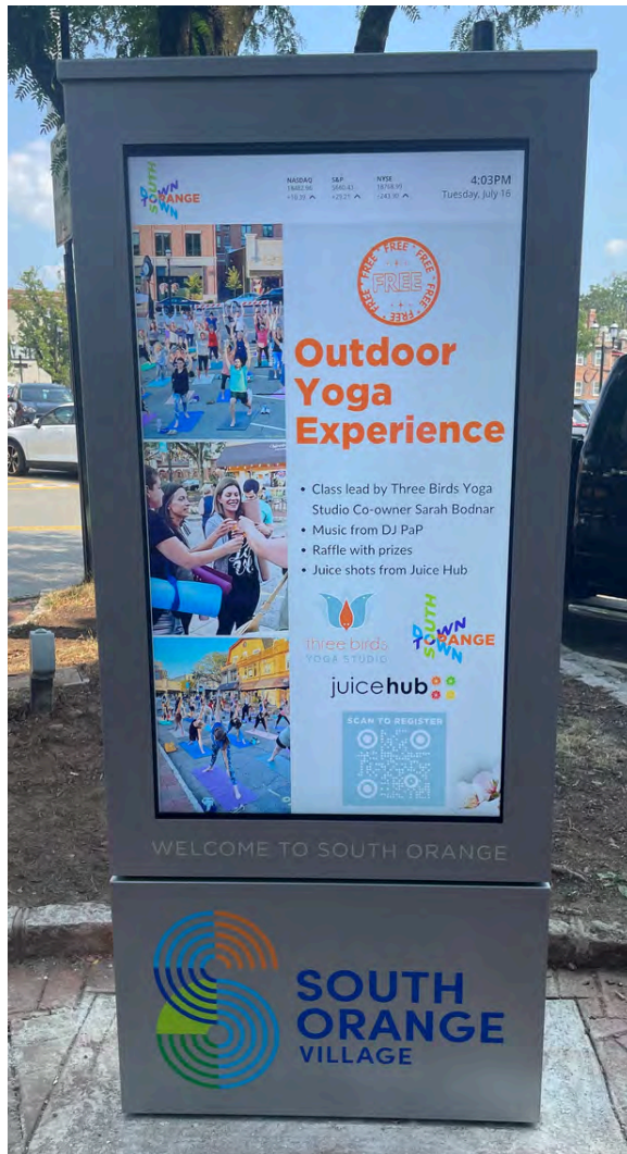
We launched our first digital kiosk, made possible through a Main Street New Jersey Transformation Grant.